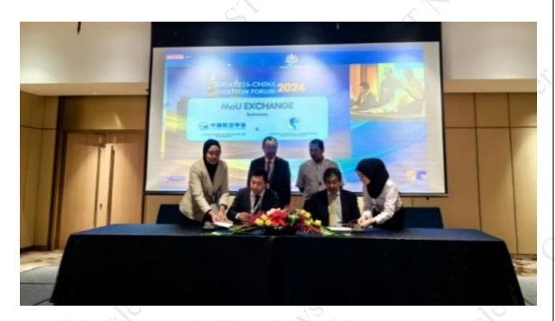
MoU signing ceremony at the China-Malaysia Aviation Forum